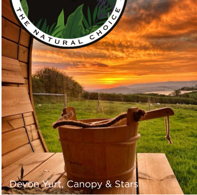
Devon Yurt, Canopy & Stars