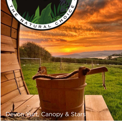
Devon Yurt, Canopy & Stars